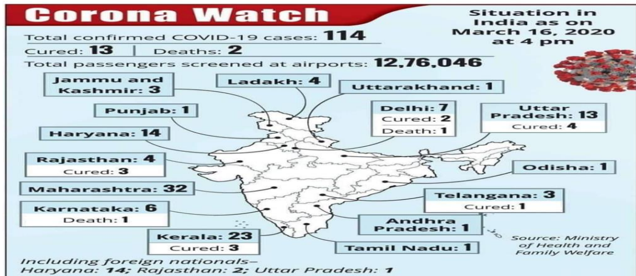
Fig 2 Cases of Corona Virus in India till 16 th -03-20 3

The Centers for Disease Control and Prevention also stated that “Everyone is telling to wash their hands and try to not to touch their face. But one should also keep in our mind is that keeping their phone sanitized is also a smart way to keep germs off their fingertips. Everyone has to consider their phone a “high-touch surface,” which could make it a carrier of the virus.”