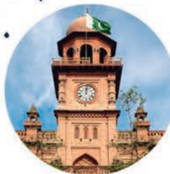
Allama Iqbal Campus