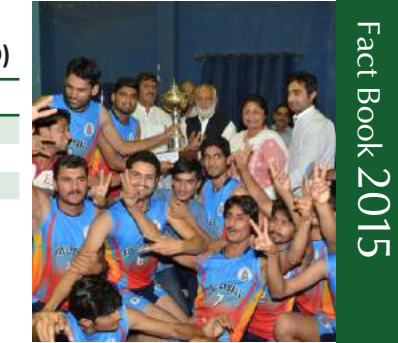
Table 33: Achievements in HEC Inter-University Sports