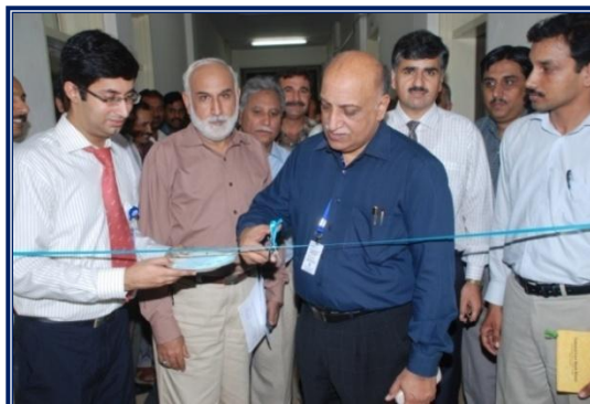
Inauguration of Planning & Developing Wing

Planning & development wing is a department of the varsity through which all spheres of activities are planned, controlled and put into developmental operations. The Wing is currently monitoring & evaluating all the development projects funded by both federal and Provincial Government. It also prepares the Telephone directory and compiles all types of statistical data related to the varsity. The compiled data is forwarded to different stakeholders like Higher Education Commission which in turn manipulates the collected data for ranking of university throughout Pakistan.