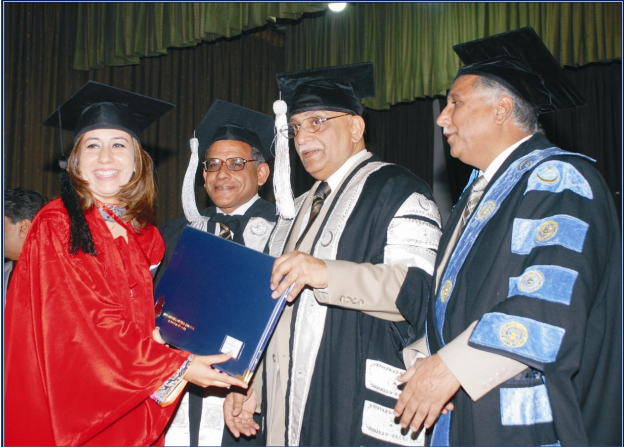
Student receiving PhD Degree from Vice-Chancellor Prof. Dr. Mujahid Kamran

The Department of Examinations is a significant Department of University of the Punjab. The whole system of Examinations is now computerized. More than 360 Examinations were conducted. The number of students has been increased day by day; current strength of students is more than 0.5 millions (5 lac). Overview and details of achievements is as under:-