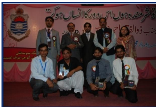
Participants of Debate Competition 2010.

The Hall Council oversees the management of 26 University hostels for twenty four hours. All 15 male and 10 female hostels are located in the Quaid-i-Azam Campus and only 1 male hostel adjacent to University Oriental College at the Allama Iqbal Campus. The international hostel (Boys Hostel No.2) Quaid-i-Azam Campus is reserved for foreign students.