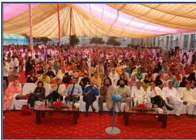
Orientation Ceremony 2010

Gujranwala Campus of the University of the Punjab was established in January, 2005. Being the youngest Campus of the University, it has progressed at such a pace that the HEC has declared it the best of all among the newly established Campuses in Pakistan. It consists of four departments, i.e., Business Administration, Commerce, Information Technology and Law dealing in seven (7) disciplines i.e., BBA (Hon), MBA,