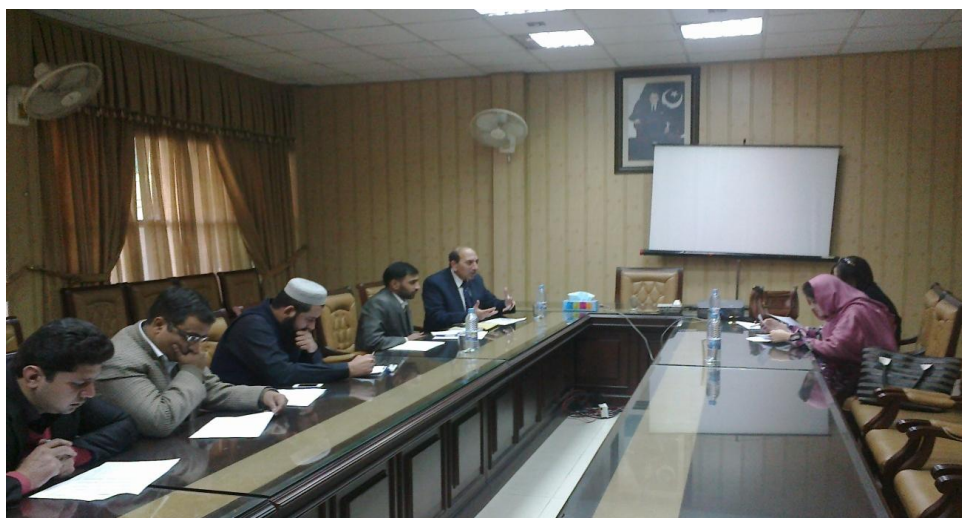
QEC team in a meeting with Faculty of Commerce to manifest the importance of Self Assessment