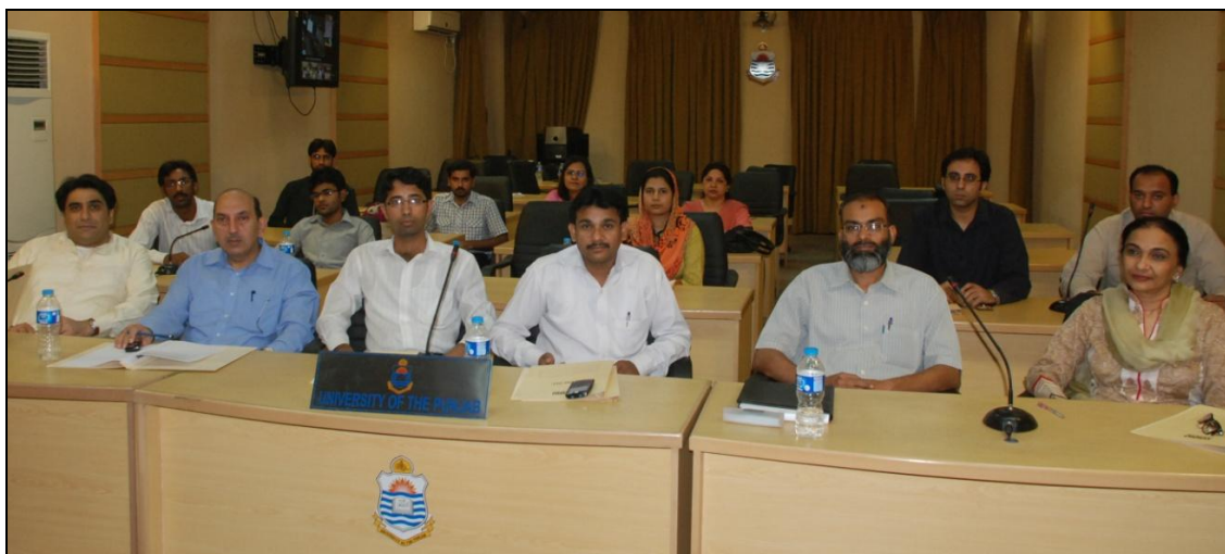
All the QECs of Lahore attending workshop on "Strengthening Programme Self-Assessment" at University of the Punjab, Lahore.