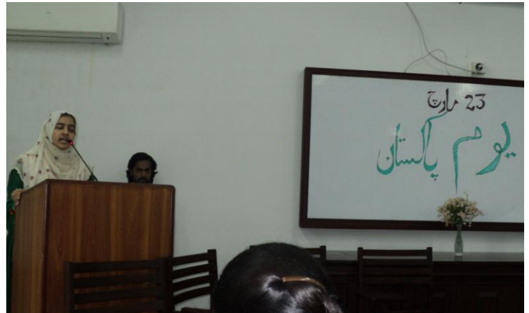
Komal Saleem (BS 6 th ) singing a national song