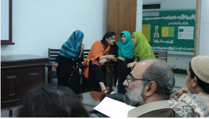
BS 6 th participating in Quiz Competition