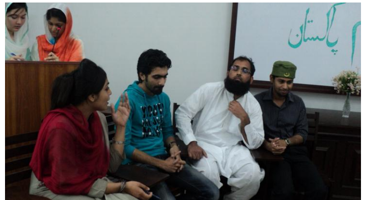
BS 8 th participating in Quiz Competition