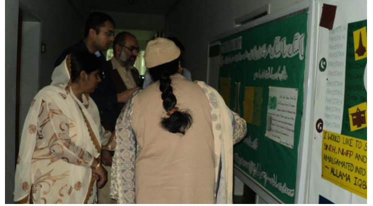
Respected Judges evaluating posters & boards designed by students