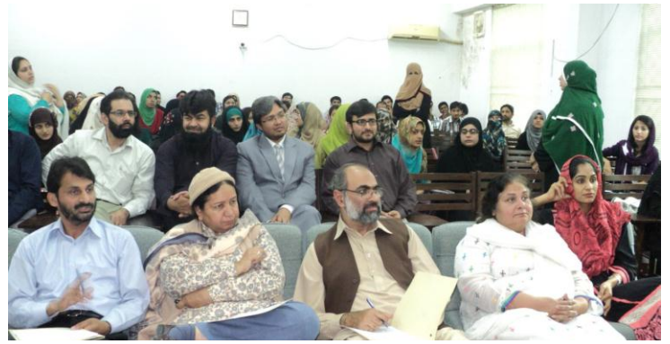
Respected Judges listening to competitors attentively.