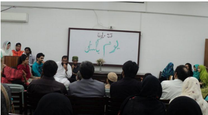
Quiz Competition in progress