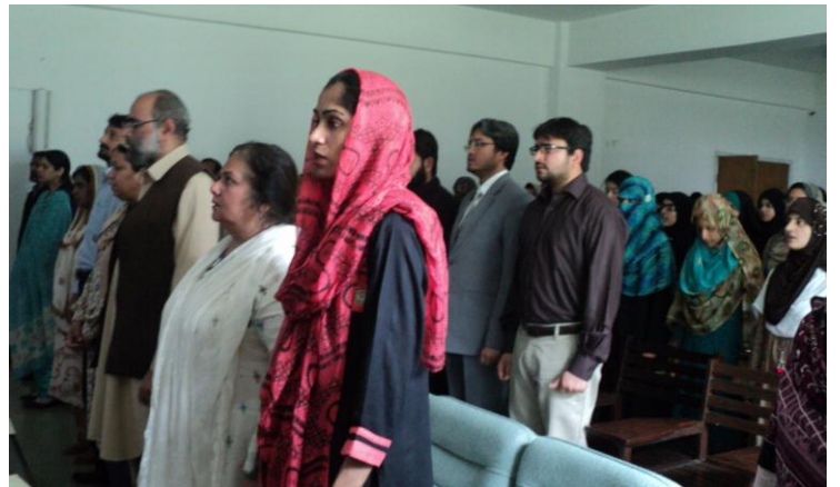
Faculty members & the students participating in the National Anthem