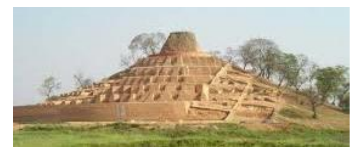
Fig 3: Stupa, Kesariya