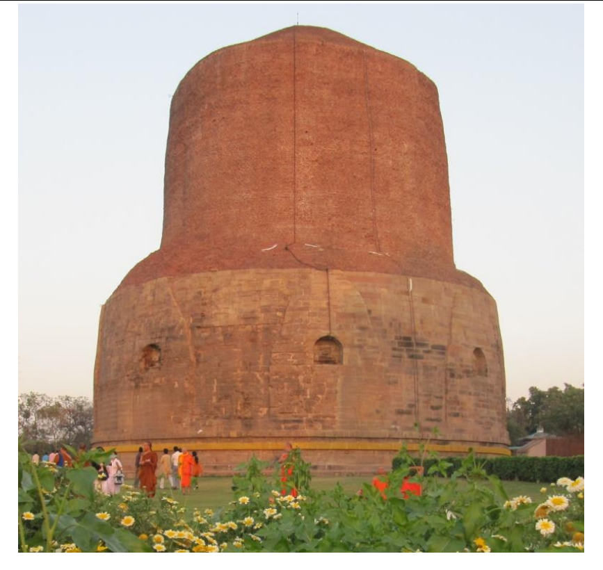
Fig 2: Stupa, Sarnath