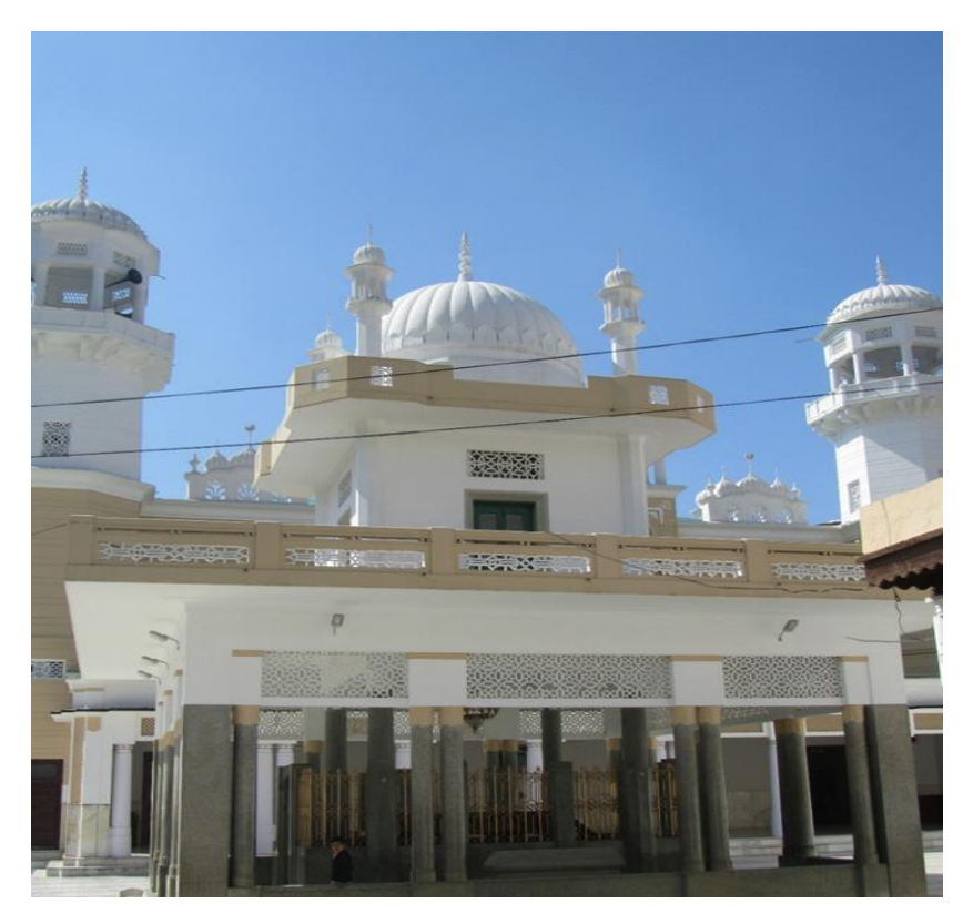
Fig. 5. Akhund shrine saidu sharif swat

Saidu is known as sharif (pious) because of the shine of Akhund. The marble flooring of the courtyard is in harmony with the exterior walls of the shrine. Original wooden elements on the entrance were replaced by replicas for protection. It is now a public space for all people.