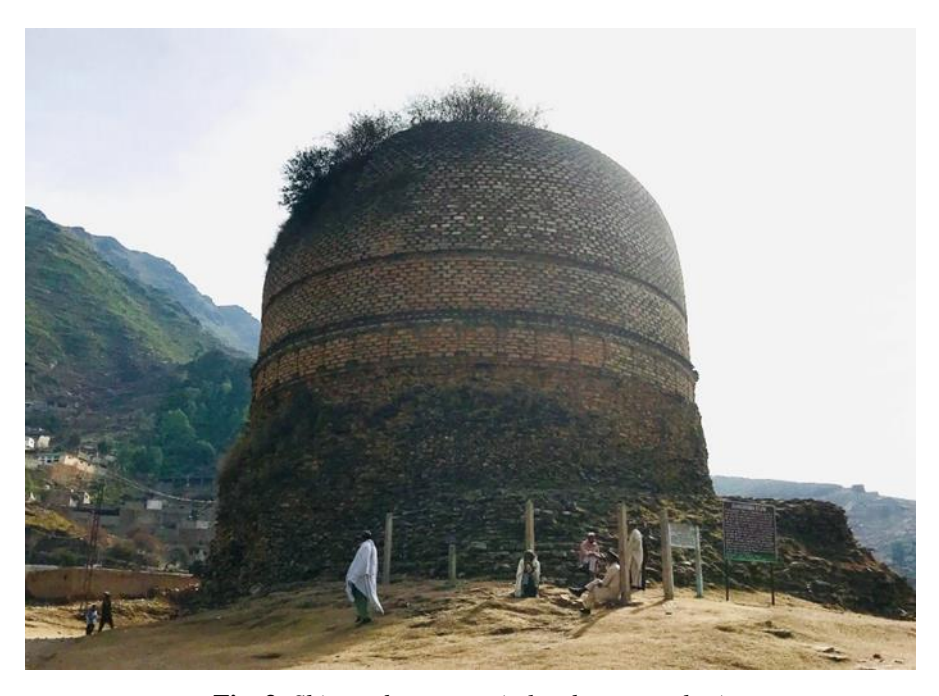
Fig. 3. Shingardara stupa (taken by researcher)

stones in the nearby place. It consists of several sacred images for worshipping and it is said to be the most preserved stupa as compared to the rest as shown in Figure.