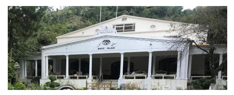
Fig 4. White Palace Marghazar, Swat.

This building was built in 1950 and was the summer house of Wali e swat. This beautiful palace lies in the area of Marghazaar, which is 7000 feet high from sea level. As shown in Figure. the palace is now used as a hotel and restaurant.