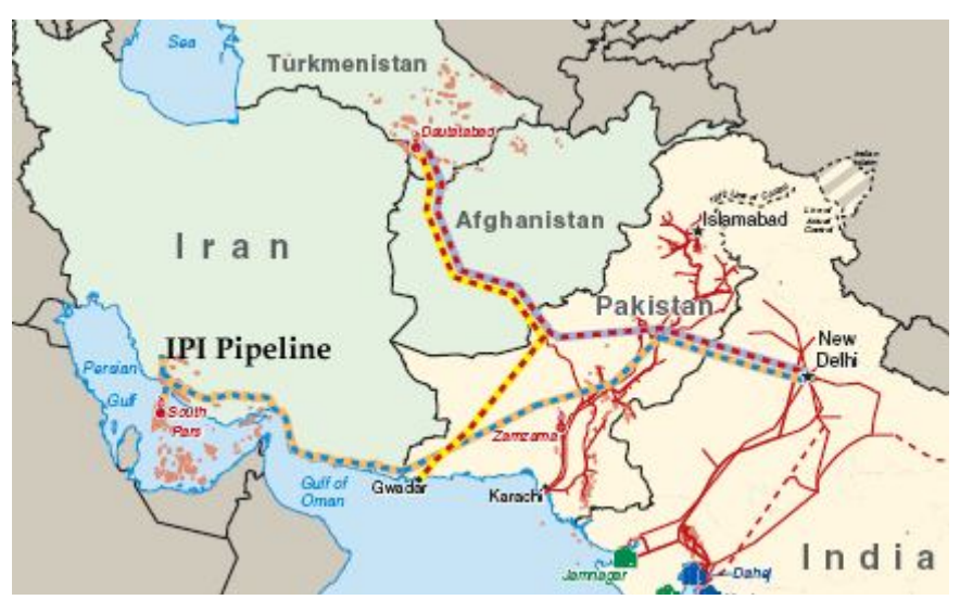
Note. From "A pipeline through a troubled land: Afghanistan, Canada and the New Great Energy Game" by John Foster, 2008, Foreign Policy Series , 3(1), p.8.

The detail of Different gas pipeline projects which originate from Central Asian region and transport its energy reserves to other countries is shown in Table 2: Table 2