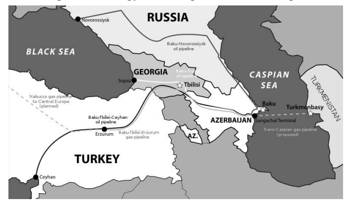
Map of Baku-Tbilisi-Ceyhan oil pipeline.