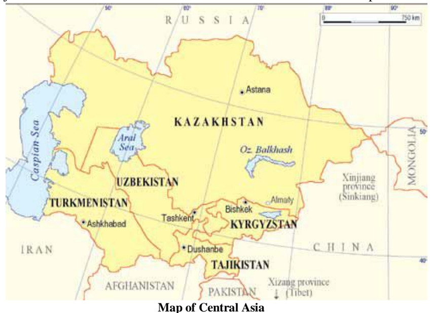
Note. From "The New Great Game: Rivalry of Geo-strategies and Geo-economies in Central Asia" by Peter Kurecic, 2010, Hrvatski geografski glasnik, 72(1), p.22.

After the disintegration of the Soviet Union the states of Central Asian were given independence. Kurecic (2010) identified that the dependence of these states on Soviet Union before their independence cost them heavily and they were unable to manage the economic affairs once they were declared independent. Immediate after independence the GDP of these states declined. They were not integrated to the world markets therefore it became a reason for the decline of GDP. After an immediate blow the GDP of the states started in the late 90s. In 2009 Kazakhstan and Turkmenistan witnessed the trends of increase in GDP. Major contribution in the increase in Kazakhstan's GDP was the oil export.