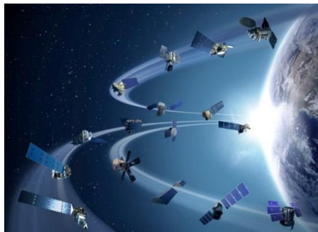
Figure 1.1: the space orbit