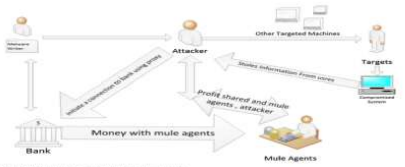
Fig. 2. Lafecycle of profit sharing among attacker and mule agents

Moreover, the profit sharing life cycle among mule agents, malware writers and attackers is also very important to understand the character of the attackers and mule agents. There is a malware writer who is working on codes and attackers is working at the mid between the target. The gained profits has been divided among attackers and mule agents which gained by the third party or the victims. It has best been described through figure 2.