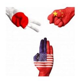
Figure.3 Implication for the USA

As Dutton said in his testimony about China's strategy on power over the seas and expanding military capabilities and increasing law enforcement. Also, have deep strategic roots on emphasis on the political and economic stability. These strategic roots are based on cultivate by China's past approach to dealing with its security concern. Currently, china continues use this approach by developing continental strategies (Dutton, 2014).