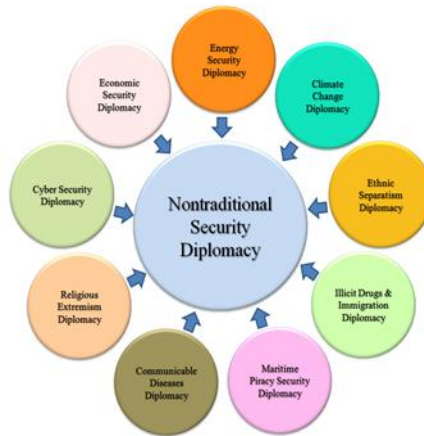
Figure 1 NTS Diplomacy covers all separated approaches

Some regional states have individually used diplomatic channels on NTS challenges and made conclusion in some of areas. While NTS diplomacy gives a multiple options to stakeholders to rethink and solve their NTS issues. These options include shaved interests (such as avoiding war), compromise (or the theory that half loaf is better than none) or barter system, in which each side extends trade concession to other over. One should keep in mind that NTS challenges are not new, but due to some historical and ideological differences, states only focused their traditional challenges, therefore, other issues remained in lowest ebb and NTS issues have always remained out of focus in the diplomatic sphere (see figure 2).