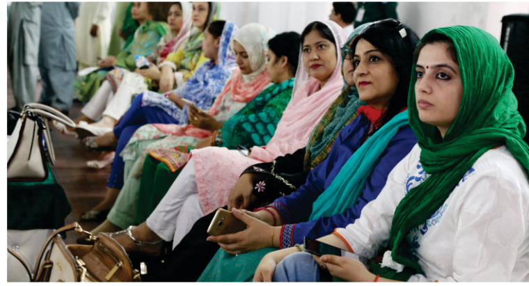
Faculty members and others listen to the address of vice chancellor.