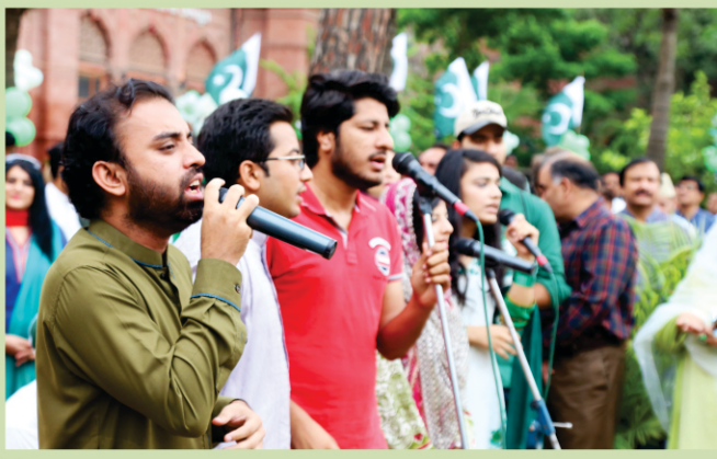
Punjab University students sing a national song.

A special Mushaira (poetry recitation), in connection with the Independence Day, was also held at the Main Hall where the faculty members of the university presented their poetry.