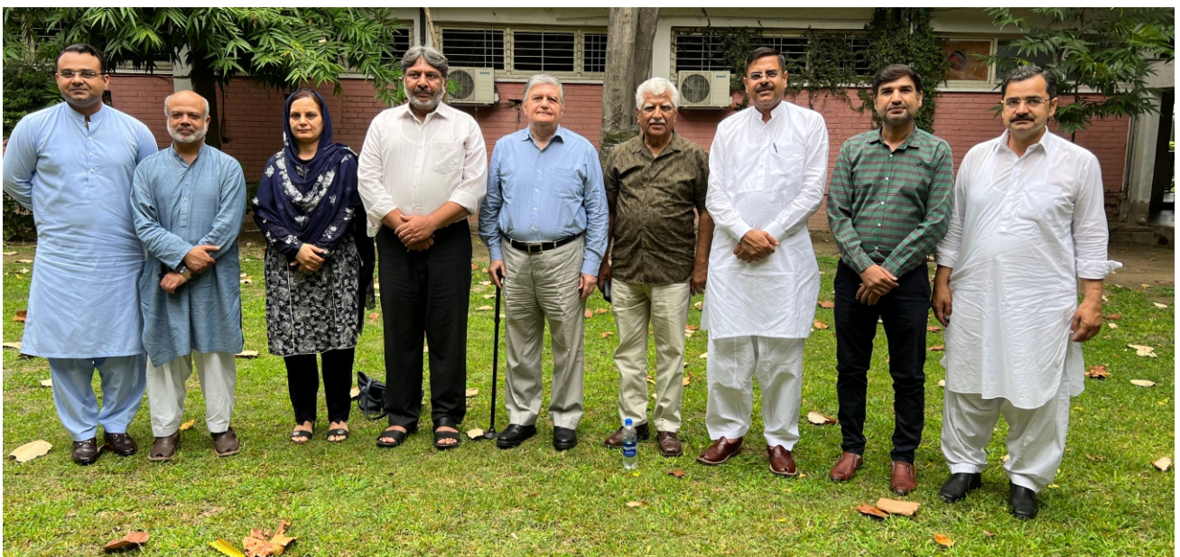
Tahir Khan, Refugee Rehabilitation and Settlement 1947-71: Issues and Policies