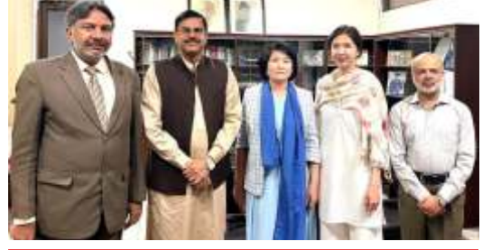
Kazakhstani Scholar's visit