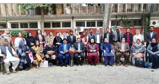
Conference on National Language Day