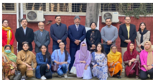
Department's Sports Gala