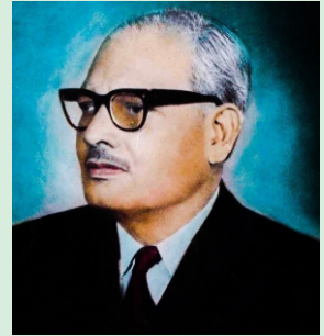
Ishtiaq Hussain Qureshi, Chairman of the Department (1948-1949)

After coming to Pakistan, in November 1948, he got selected as Professor of History in University of the Punjab and he also became Head of the Department. However, he could continue with his academic work only for a few months as in February 1949, he was called by the Prime Minister Liaquat Ali Khan and was appointed as Cabinet Minister. Till 1954, he held different ministerial portfolios. He also played a leading role in the negotiations which led to the passing of Objectives Resolution. In 1954 when the Constituent Assembly was dissolved, he joined Columbia University as Professor of South Asian History. His five years' tenure in Columbia was academically the most fruitful period of his life in which he wrote some of his most important works.