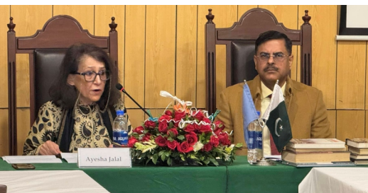
A Session with Prof. Ayesha Jalal