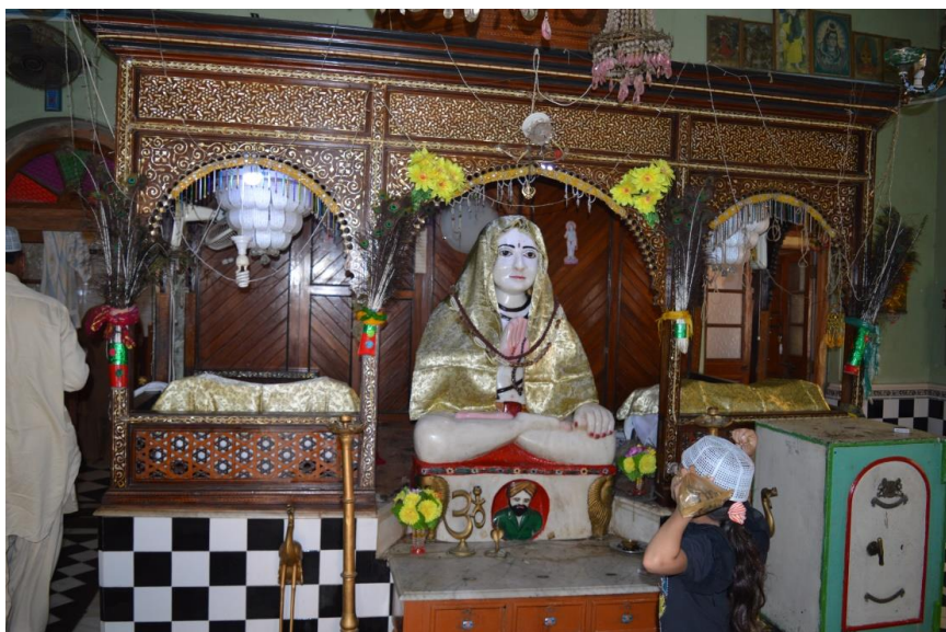
Figure 2. Sri Chand in Raj Ghat Darbar , Thatta(Taken by author)