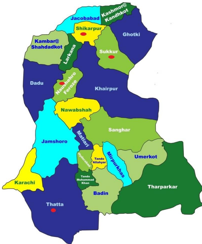
Figure 1. The map of Sindh: dots represent four cities, where four major Udasi centers are located.

With the mass exodus of Hindu from West Punjab in 1947, the famous Udasi centers of Dera Baba Bhumman Shah (Okara), Gujranwala, Bhai Pheru, Lahore and other cities were abandoned and deserted. On the contrary, those in Sindh survived the onslaught of partition, they only became even more syncretic and inclusive and are still so.