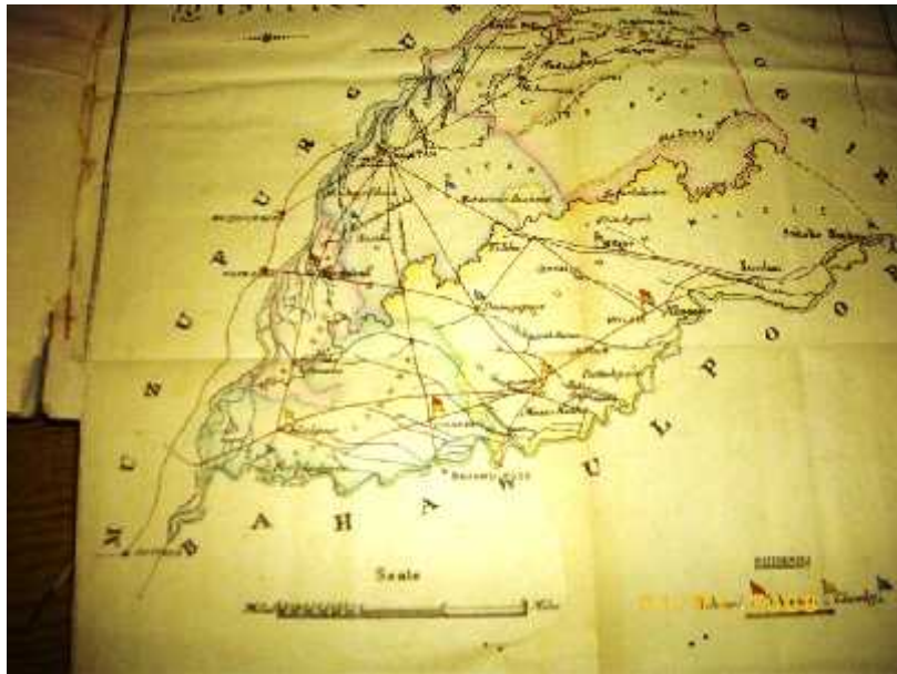
Figure 1 Map of British Multan Before 1882 20

Focusing on the development in one Tehsil, the paper shall deal with the administrative centrality and marginality in Sara-i-Sidho region in three phases.