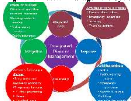
Figure 2: Disaster Management Cycle