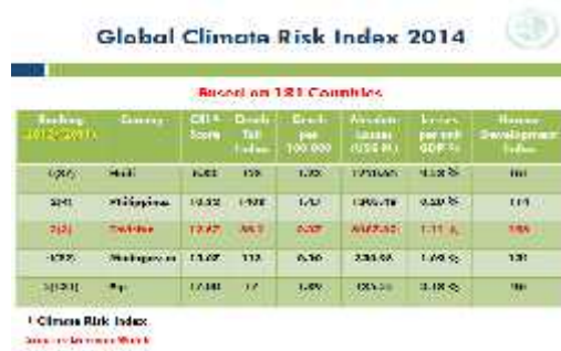
Figure 1: Global Climate Risk Index 2014

The Table 1 shows the list of natural disasters in Pakistan.