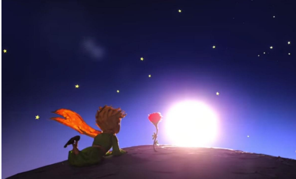
The little Prince on his Asteroid, taming his friend Rose !

Saint-Exupéry develops a unique imagery through the character of rose and the way it is tamed by the love and innocence of the little prince throughout the parable. The concept of taming the rose by the little prince is in fact ‘taming of the essence’ and the ‘core’; this constitutes the taming of the self and the soul, and taming of uniqueness of the essence in the entire world. If we take the little prince’s rose as an example, what comprises the taming process is actually the time that one spends with one’s rose: as the little prince tames his beloved rose, the phenomenon of taming takes the prince away from the delusion of this material world’s grandeur; on the other side of the picture, the little prince reconciles with his real, unique self. The phenomenon of taming develops, flourishes, unfolds and exhibits itself with other themes of individuality, realization and singularity of the uniqueness of the self, and eventually leads towards the discovery of the ‘self’ as well as of the ‘other’. The rose of the little prince is reflected in the poetry of Rumi as he writes in his Diwan-e-Shams :