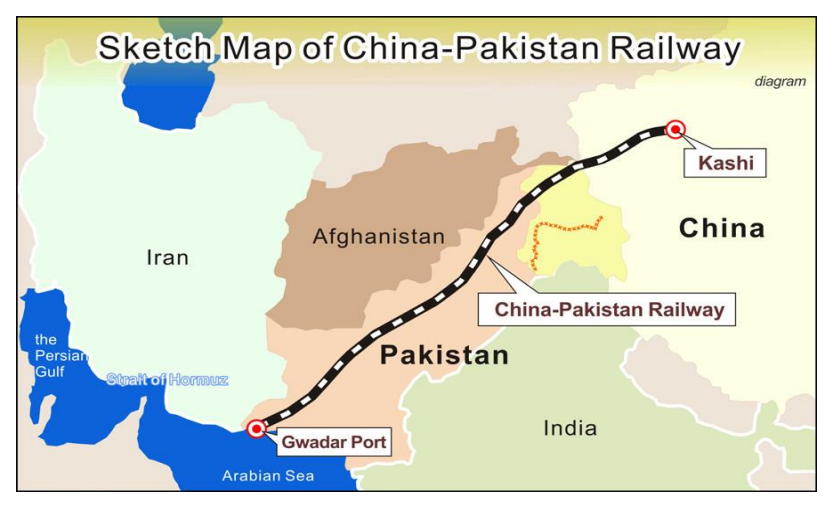
Ni-Hao-Salam, December 2013.

of Rs. 72 million to transport a possibility learning for the structure of a rail connection with China to further improve economic dealings between China and Pakistan in 2007.<sup>39</sup> The structure of new tracks and the enhancement of the old ones are also a part of the China-Pakistan Economic Corridor Project. The Authority of Pakistan has accepted mega-projects, worth $ 7.89 billion for the railways. The amount of $ 3.65 billion has been assigned for the up-gradation of the present railway pathway from Karachi to Peshawar (ML-1).<sup>40</sup> A new track would be constructed from Gwadar to Jacobabad via Besima and Khuzdar at the cost of $ 4.2 billion. A protected and consistent railway linkage can safeguard China's entree to the energy-rich Middle East through Gwadar and other harbors of Pakistan.<sup>41</sup>