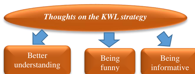
Figure 1. Students' Opinions on the Courses in which KWL Strategy is Applied

Thoughts on the KWL strategy: In order to determine the opinions of the students in the experimental group regarding the teaching processes in which the KWL strategy is applied, the students: "What would you like to say about the KWL Strategy?" The question was asked. Students' opinions about the courses in which the KWL Strategy is applied are grouped under three sub-themes as shown in Figure 1, and these sub-themes are given below: