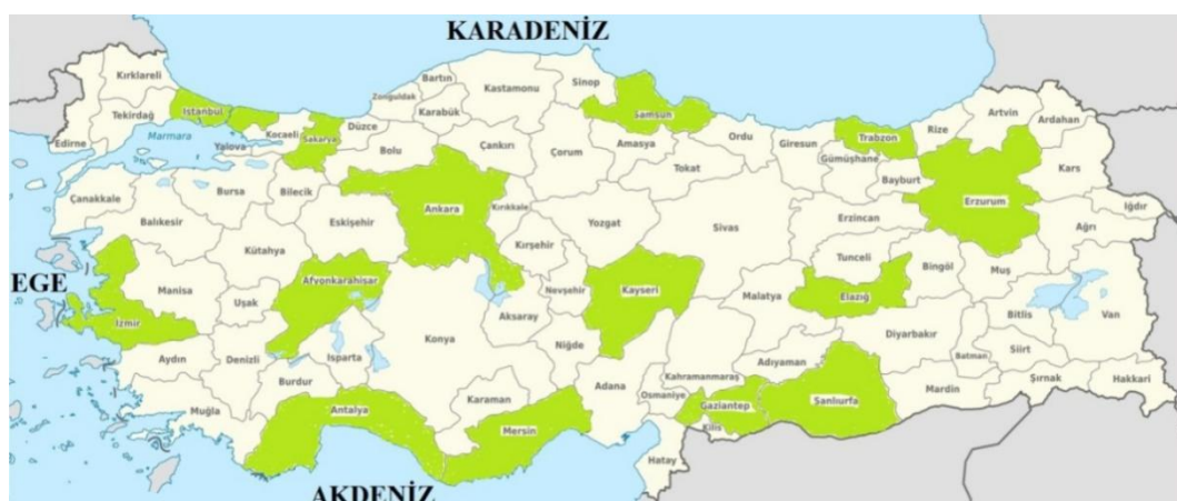
Figure 1. Cities selected as sample