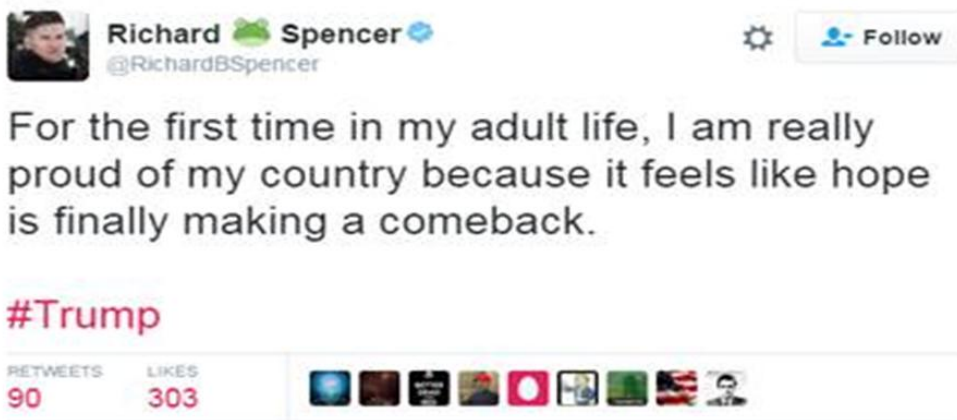
Figure 2. Tweet of Richard Spencer

White Nationalists are looking for maintaining their national identity while at the same time ensuring survival of their race through political and economic dominance. Factors such as multiculturalism, the changing demographics of the USA, and the civil rights movements are taken as a threat to White's supremacy and identity. On the other hand, White class has the desire to establish a Whit-ethno state. In order to achieve this objective, two strategies -- mainstreaming and vanguardism -- are usually adopted. 'Mainstreaming' focuses on the infiltration and subversion of the exiting institutions, especially political, for promoting the cause of White Nationalism. Similarly, 'Vanguardism' seems to be more of a radical approach. As SPLC indicated, 'Alt-right' is the recent formulation of white nationalism. Public demonstrations, college speaking engagements and propaganda distribution are some of the tools used by it (White-nationalists, n.d.). A number of people having loose bonds of connection having far-right tendencies are included in it. Right Spencer, head of the National Policy Institute --a think tank advocating for the supremacy of White Americans -- was the first one to coin the word 'alt-right'. Introduction of the new term was aimed at gaining support of the people who are not in the favour of mainstream conservatism such as White supremacy and racism.