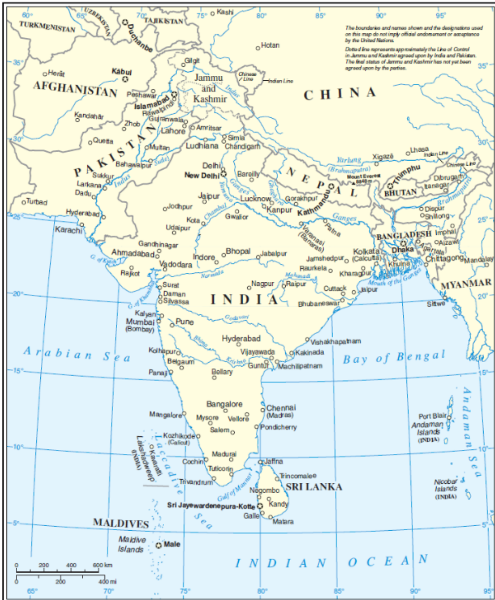
Figure 3: Map of South Asia