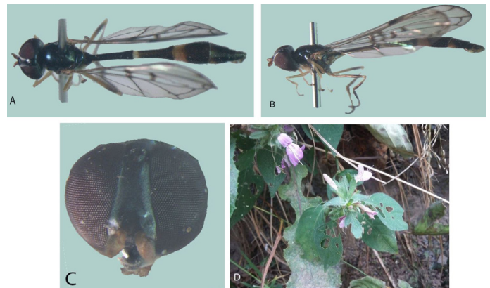
Figure 2: Baccha maculata . A–C (Female): A: Dorsal view. B: Lateral view. C: Face: frontal view. D (Host): Barleria cristata .

Material examined (13 ex.): Pakistan: Punjab