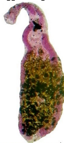
Figure 2: Heterotestophyes gibsoni sp.n. entire worm, holotype photomicrograph (183x)