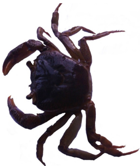
Figure 2: Allacanthos crab Museum Specimen.

shallow. The postfrontal portion was very distinct with shallow between them. In the dorsal portion front margins were straight. The upper orbital portion was not crinite. A lower orbital portion had faint papillae. The Claws were rounded with fleshy tufts, typically no spots. They had pereopods with fine sparse hairs. First pereopods completely closed. They were different. Mostly right was larger than left. Palm was swollen. Finger gripping when closed. They had triangular teeth. All the abdominal portion was free.