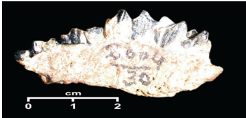
Figure 2: D. minus , buccal view of a fragment of right maxilla having upper fourth deciduous premolar, and first, second, and third molars (PUPC 04/30).